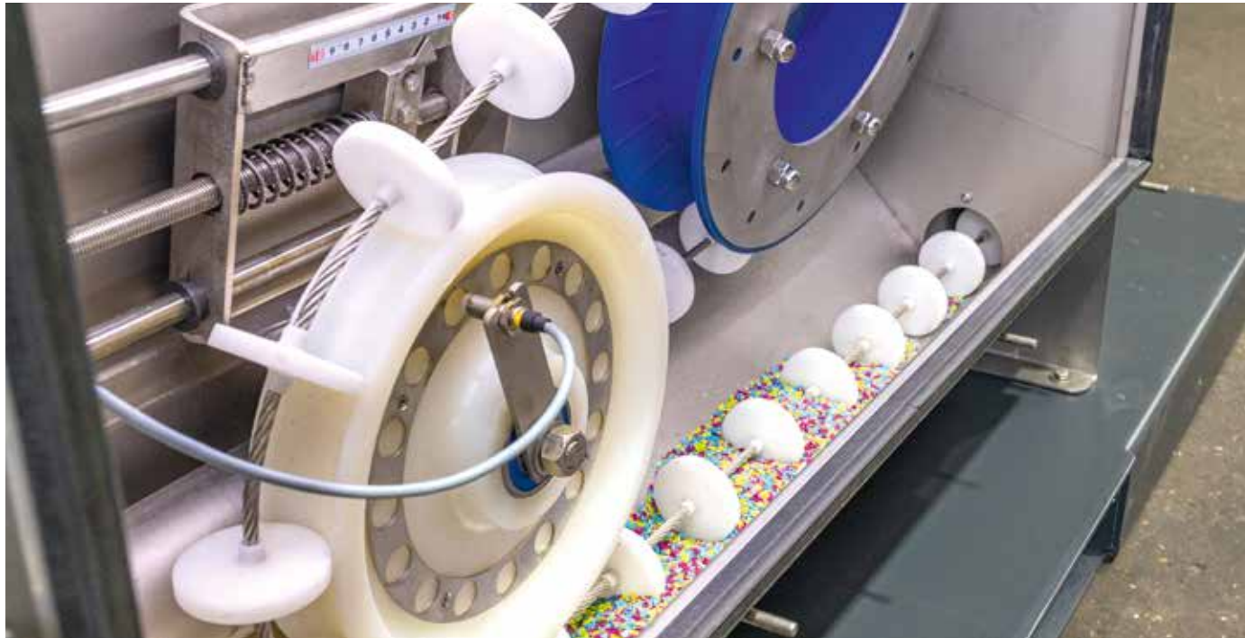
Drive station with friction wheel and an integrated clamping device.